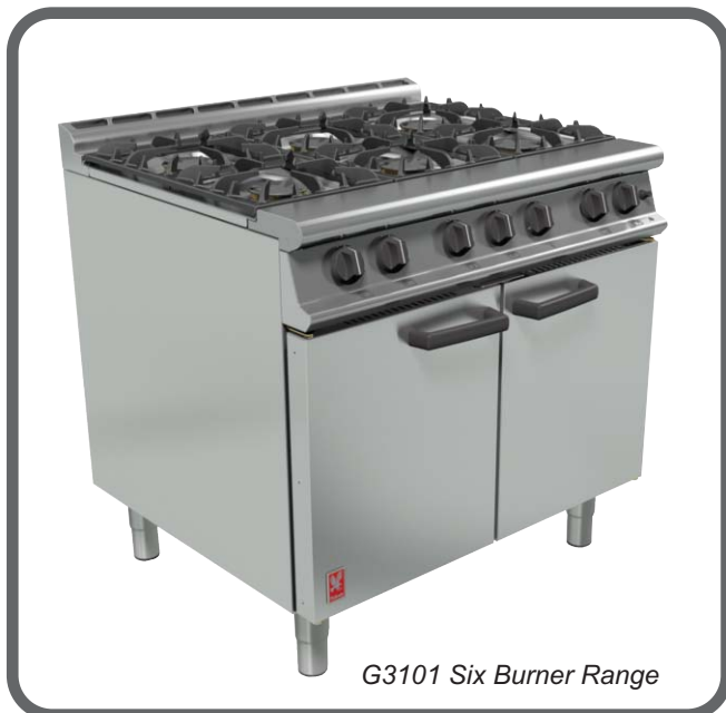
G3101 Six Burner Range